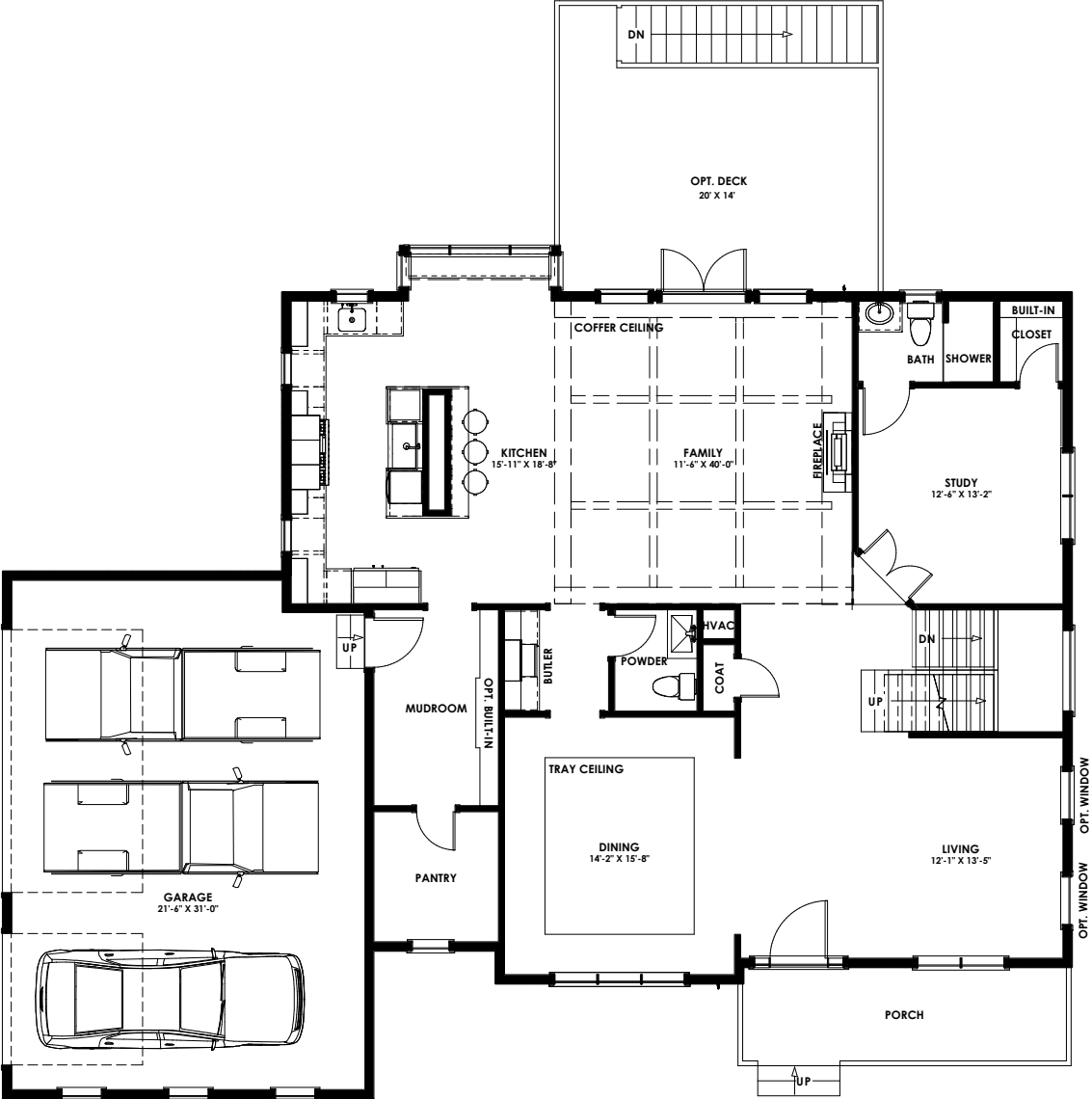
MAIN LEVEL 1,814 SQ FT