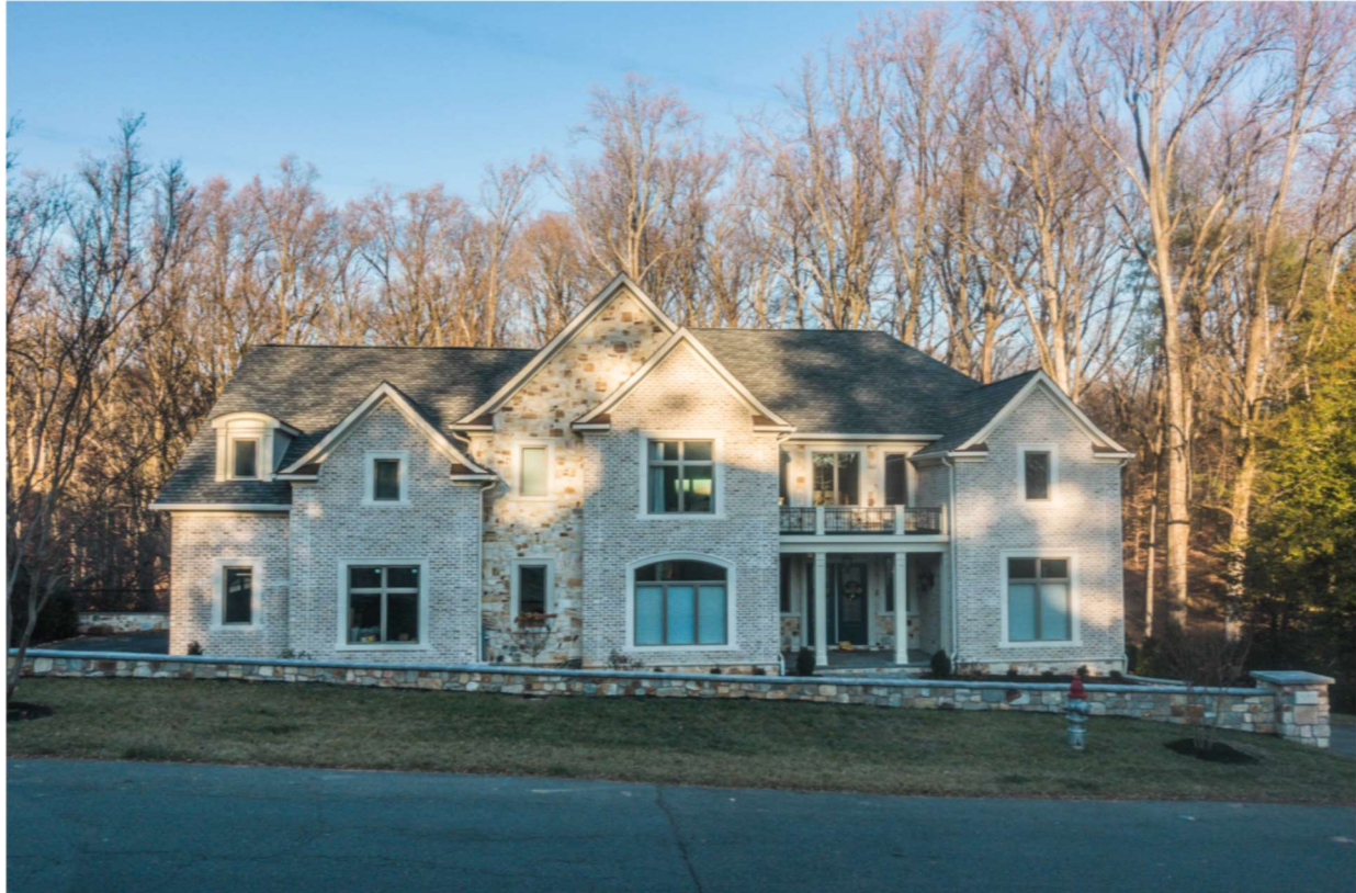
Elevation A - Standard