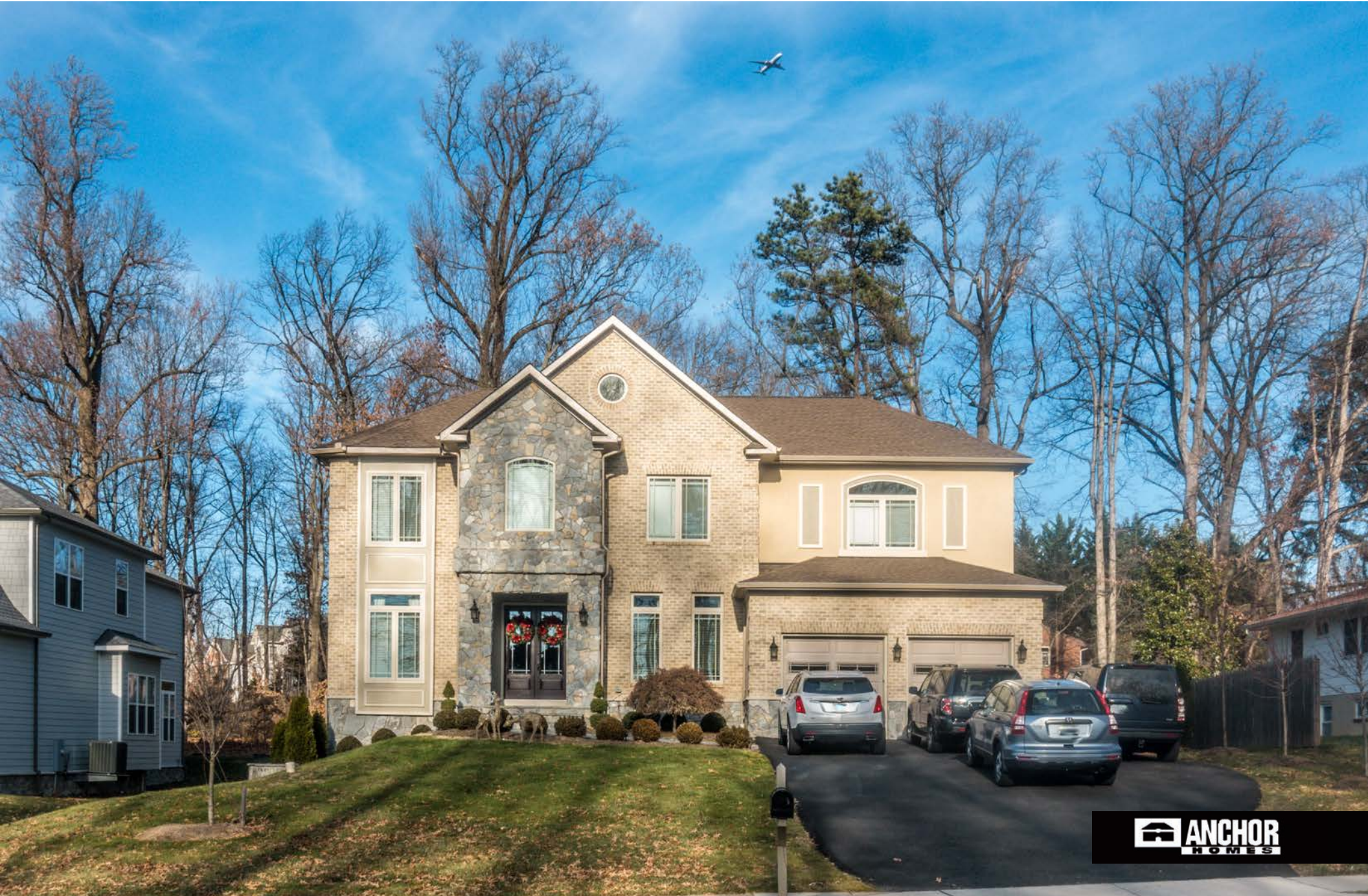
The Opal Model